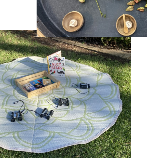
Early learning lasts a lifetime....