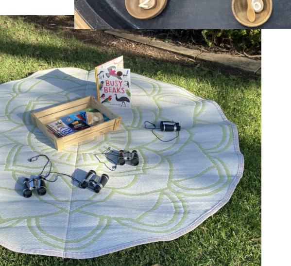
Early learning lasts a lifetime....